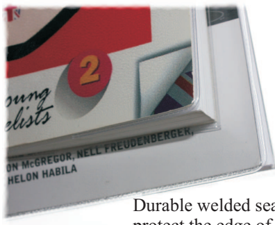
Durable welded seams protect the edge of the book.

Using the covers is simple - first slip the back cover through the two strips, then slide the front cover into the pocket. Slide the book back through the strips until taut, then fold the overhand under the strips.